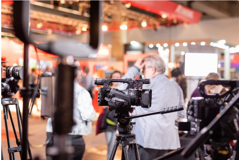
The Image Creation Hub offers product innovation, training, networking and much more.